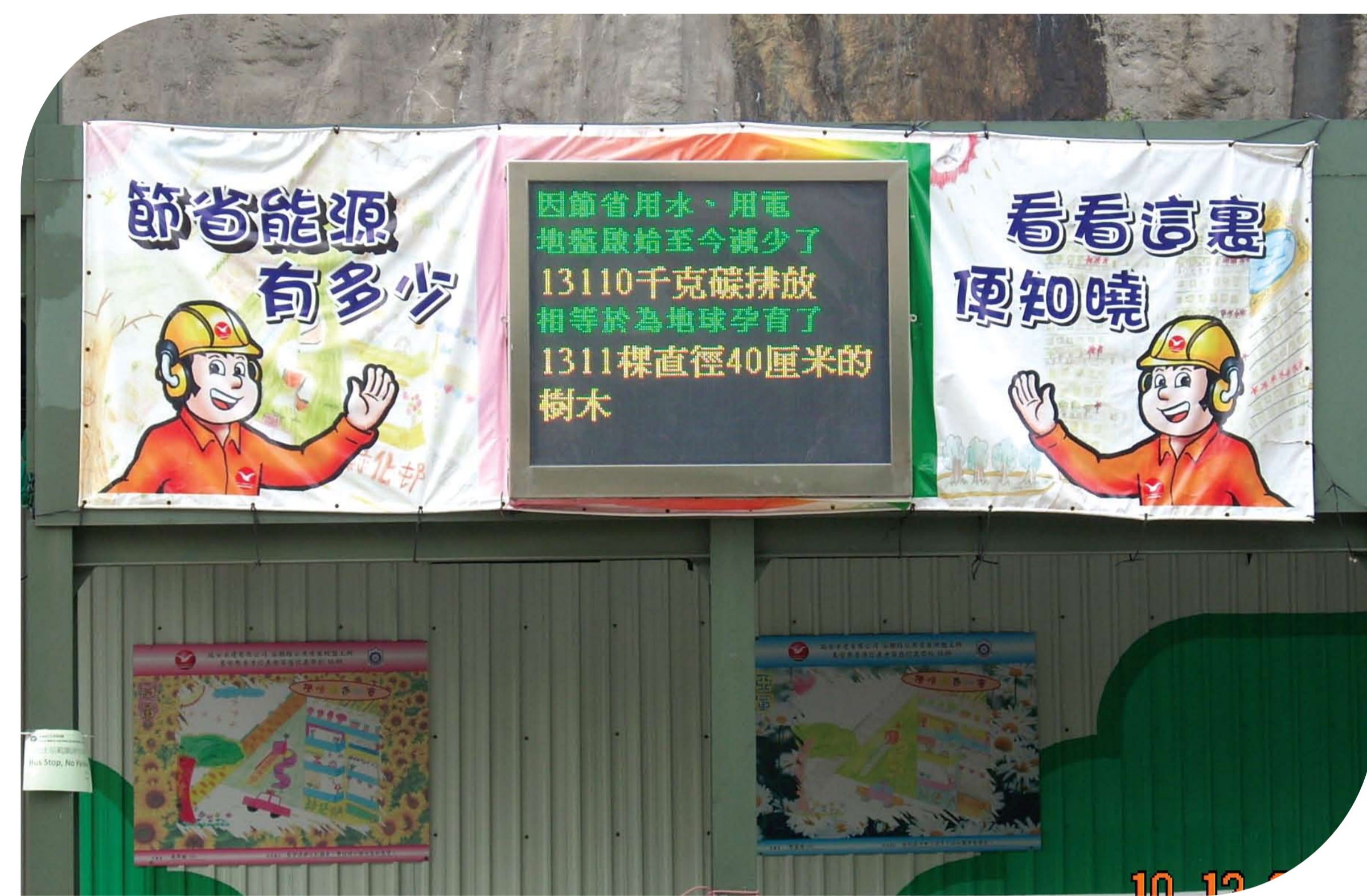
透過液晶體顯示屏向公眾發放地盤減碳排放資訊。 LED display panel to instill project carbon emission reduction information to the public.