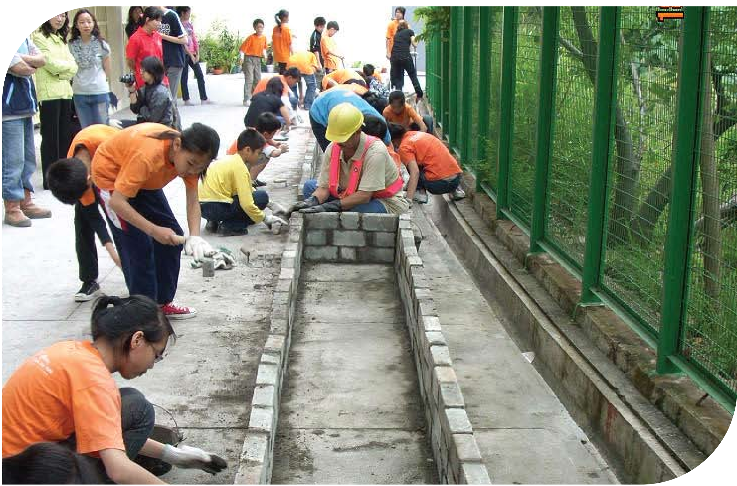
為鄰校築建花園提供材料及技術指導，培育年青一代綠色意念。 Provide materials and technical support for the construction of planters in neighboring school to nurture green awareness of younger.

We are committed to corporate social responsibility, and strive to minimize the impacts of our activities on the environment. We care for the environment, and make every effort to promote our carbon emission reduction efforts and results, maintain good dialogue with our neighbors, and spread green messages to the next generation. We are committed to upholding the Shui On Spirit to foster sustainability.