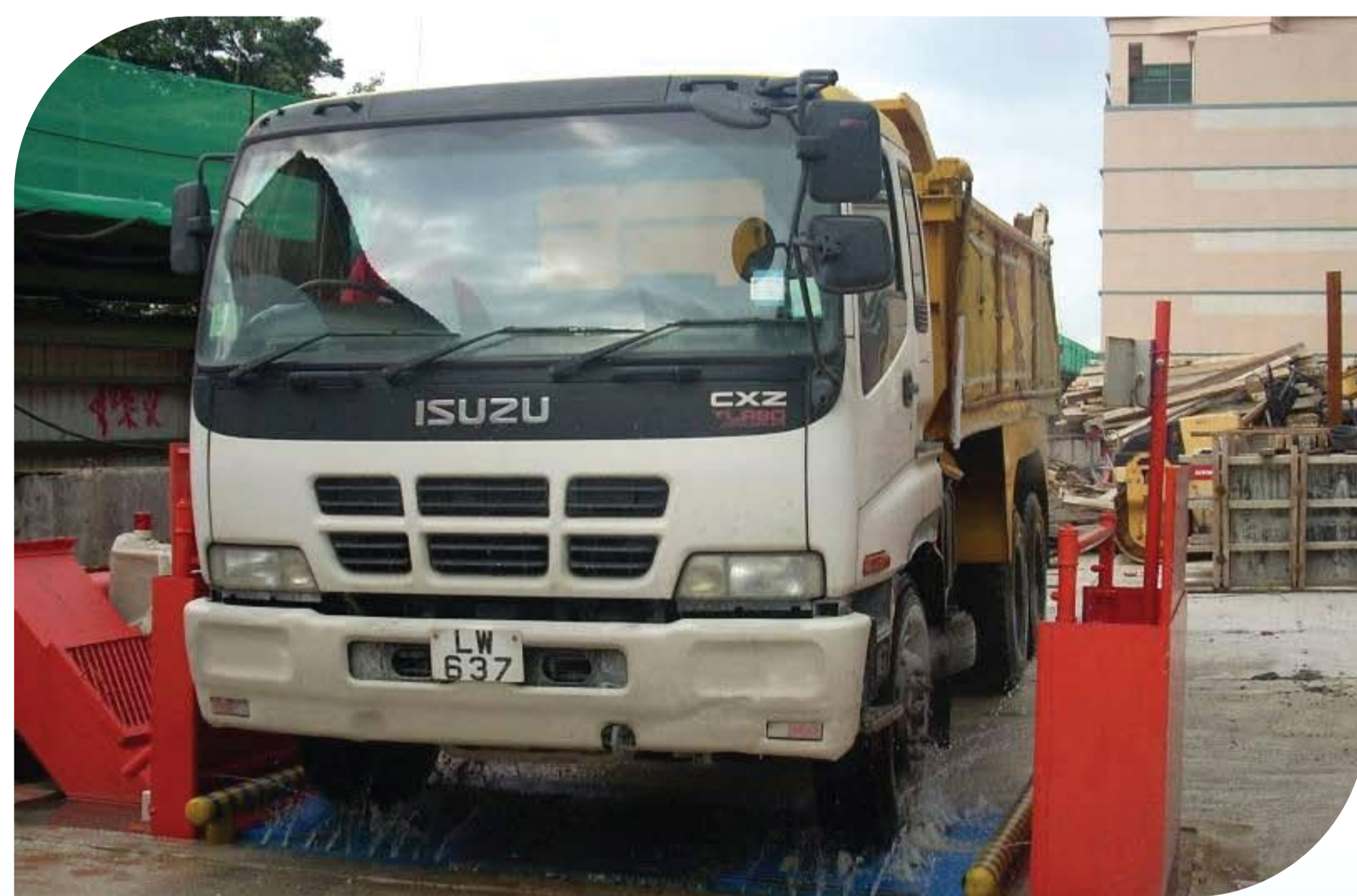
裝設自動洗車池，確保車輛離開時不帶有泥塵。 Automatic wheel washing machine to remove dust from trucks when leaving the site.