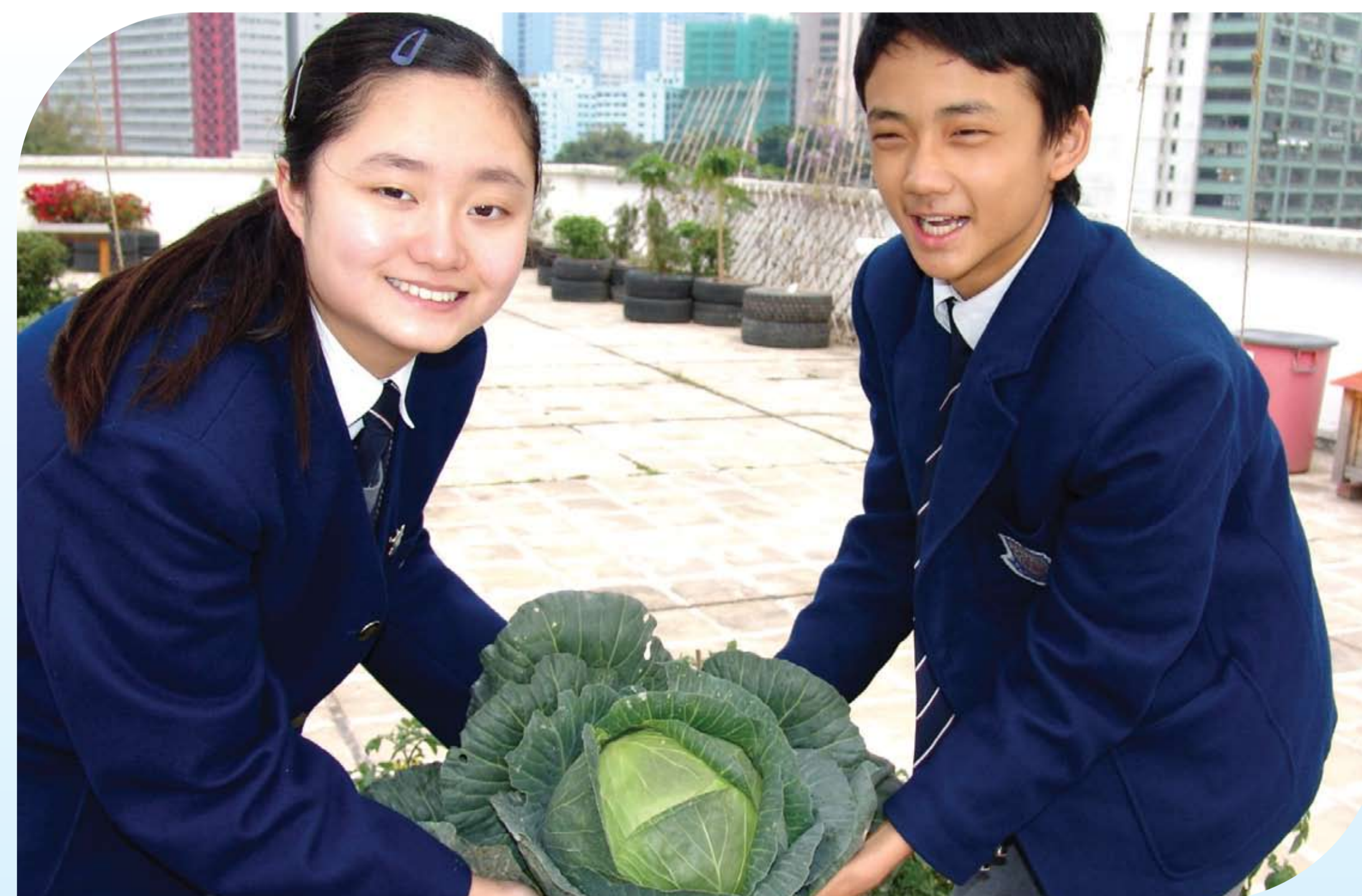
獲獎椰菜：全港有機種植比賽亞軍 Award-winning large cabbage: second place in a territory-wide organic farming competition