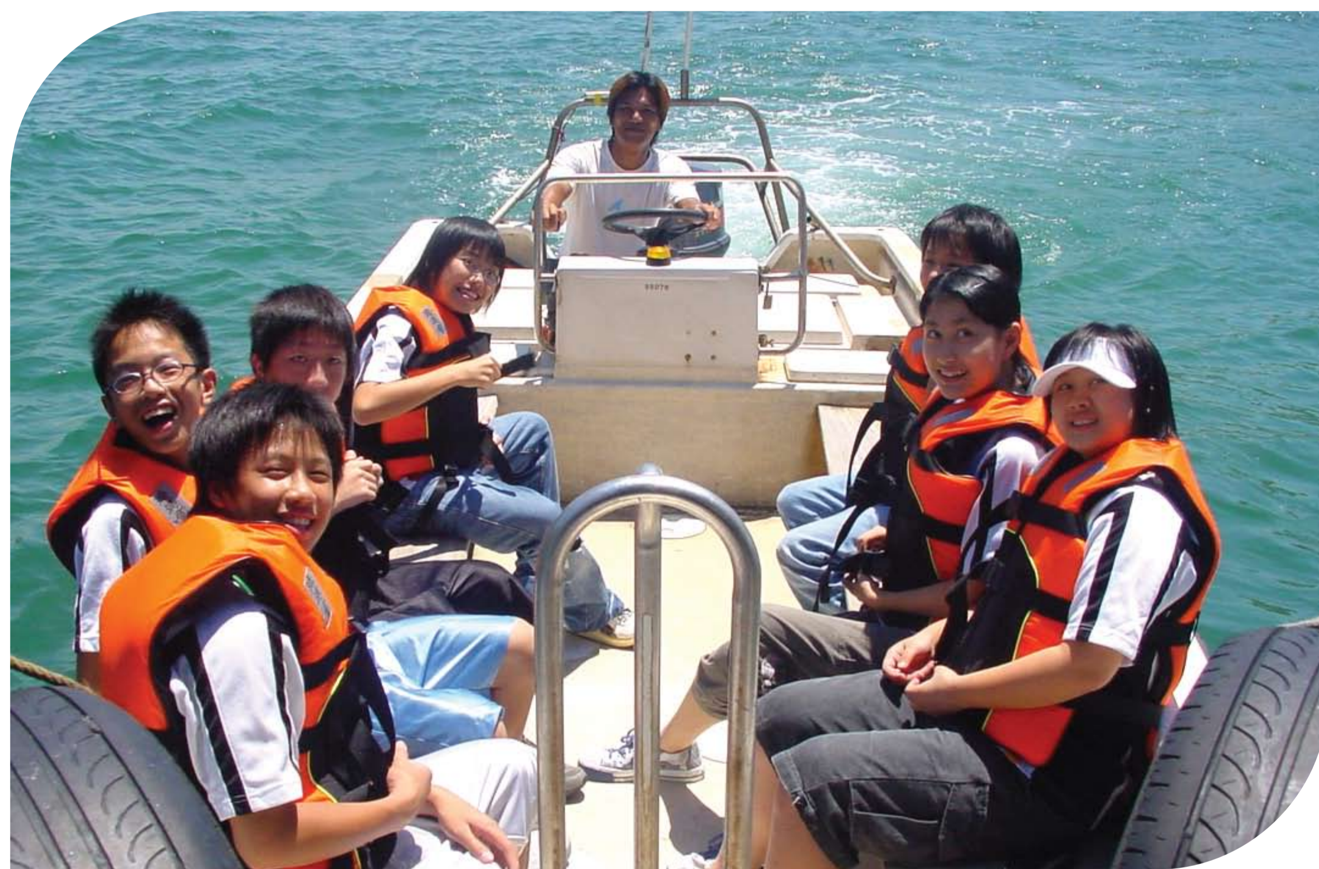
學生參加西貢海岸生態遊。 Students in the Eco Marine tour in Sai Kung.