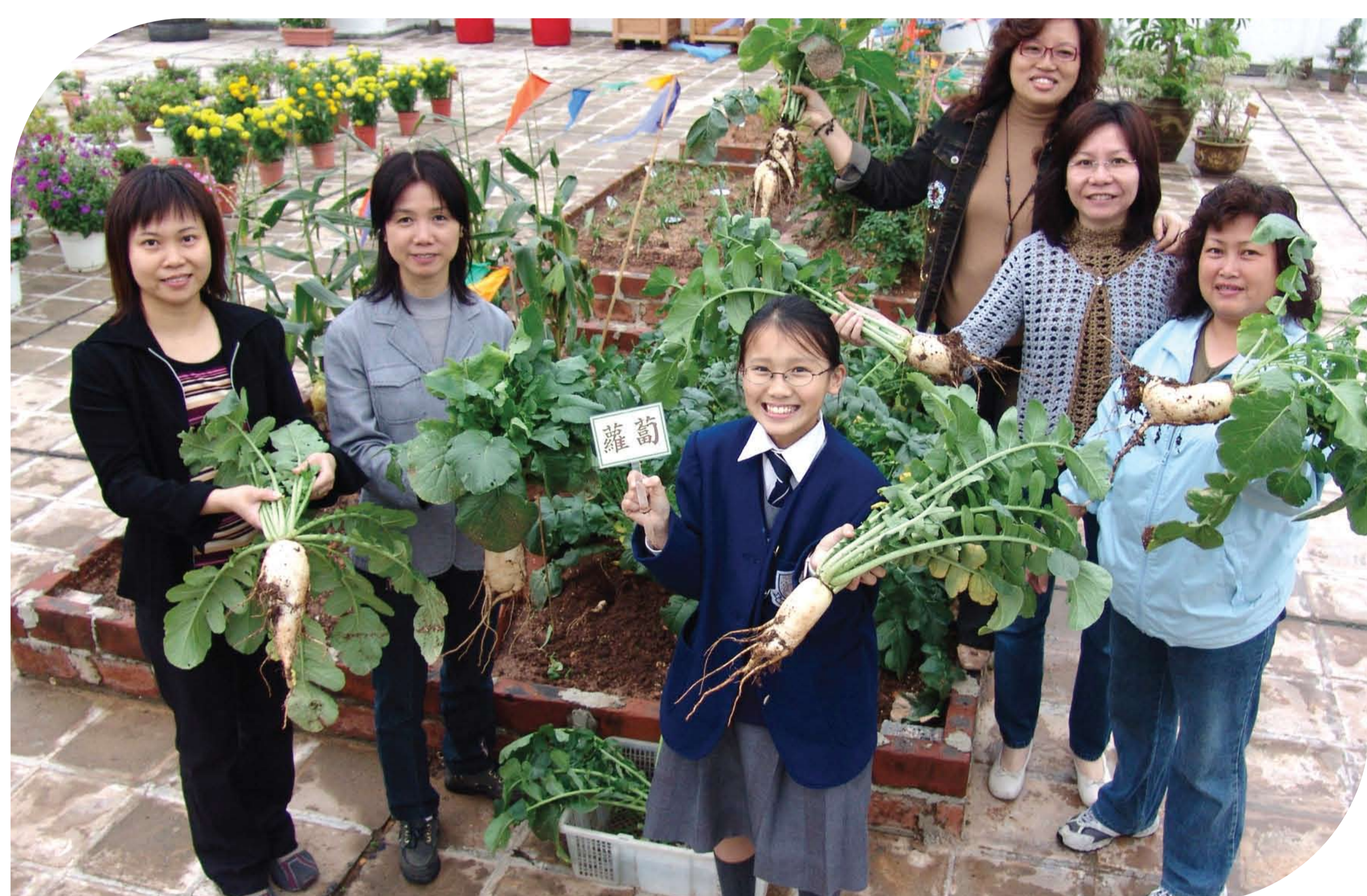
家長教師會的綠化小組活動：收割蘿蔔 PTA's green group activity: harvesting turnips

It is extraordinarily meaningful to run environmental protection education programmes in our school since the school context is a ground for our future. Through adopting environmental construction, curriculum, strategies and diversified activities, students' conservation consciousness is nurtured. More importantly, they become more responsible in environmental issues.