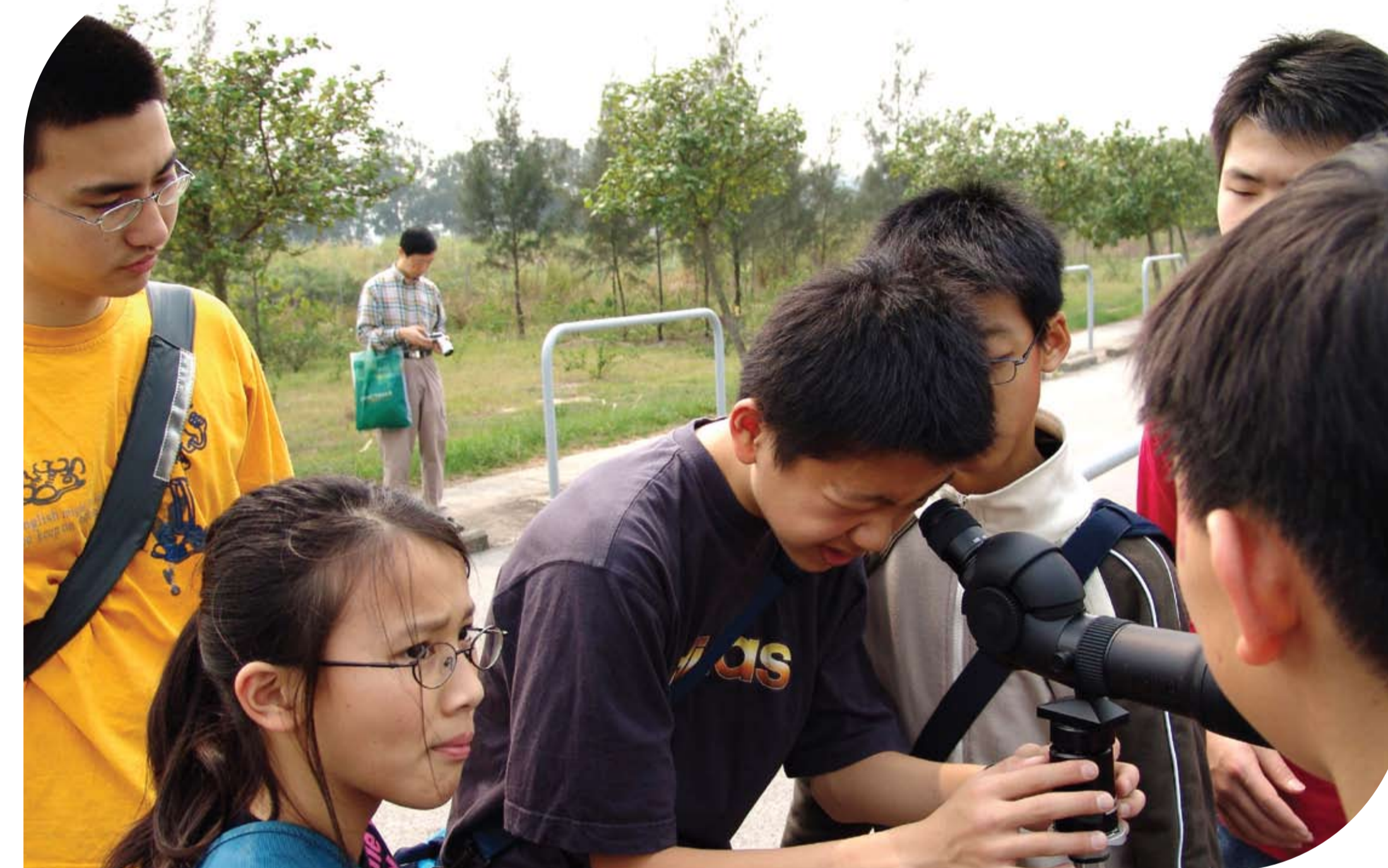
學校環保大使參與基礎環保章訓練：在南生圍觀鳥。 Environment Protection Ambassadors watching birds in Nam Sun Wai: activity for the Basic Badge.