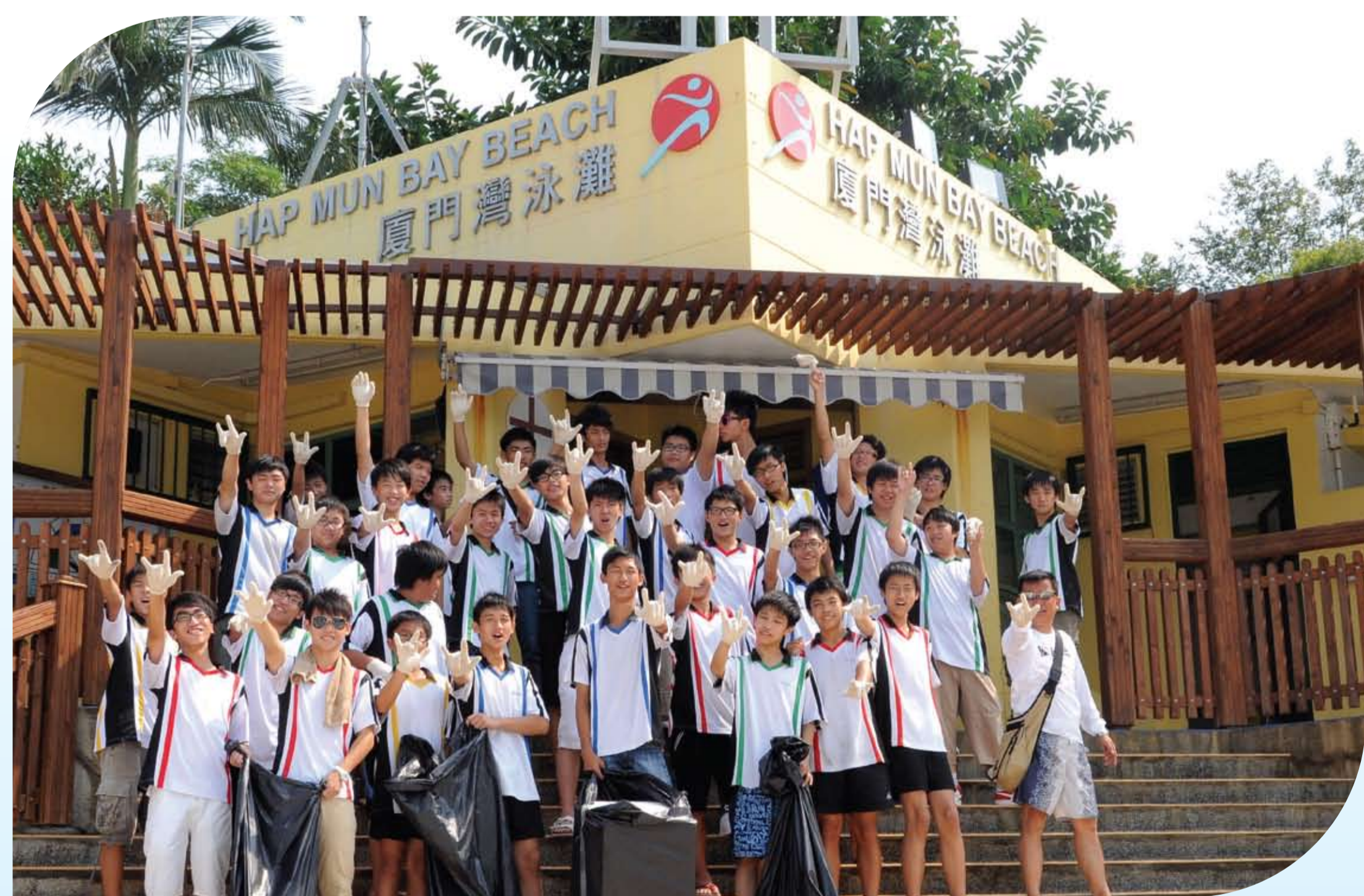
同學在西貢廈門灣清潔海岸。 Students cleaning up the coast at Hap Mun Bay, Sai Kung.