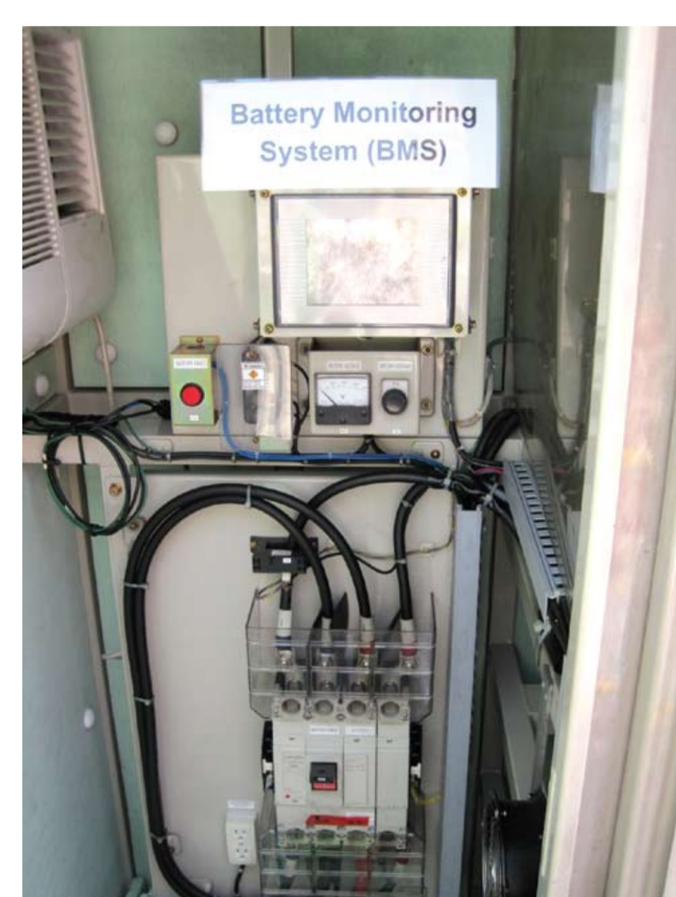
電池效能監察系統 Battery Monitoring System