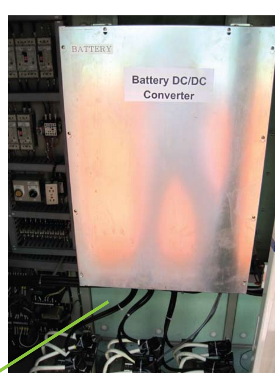
混能轉換系統 Hybrid Energy Conversion System