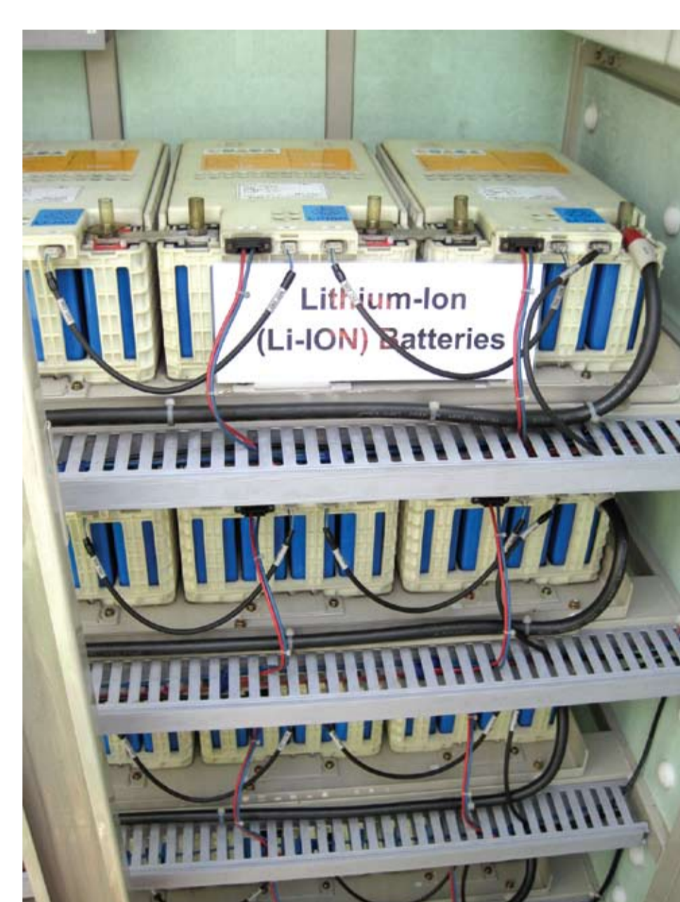
鋰電池櫃 Lithium-ion Batteries Panel

Hongkong International Terminals is committed to protecting our natural environment and resources through conservation programmes and the application of green operations solutions. Many of our green initiatives have exceeded the present statutory requirements and set the benchmarks for the industry.