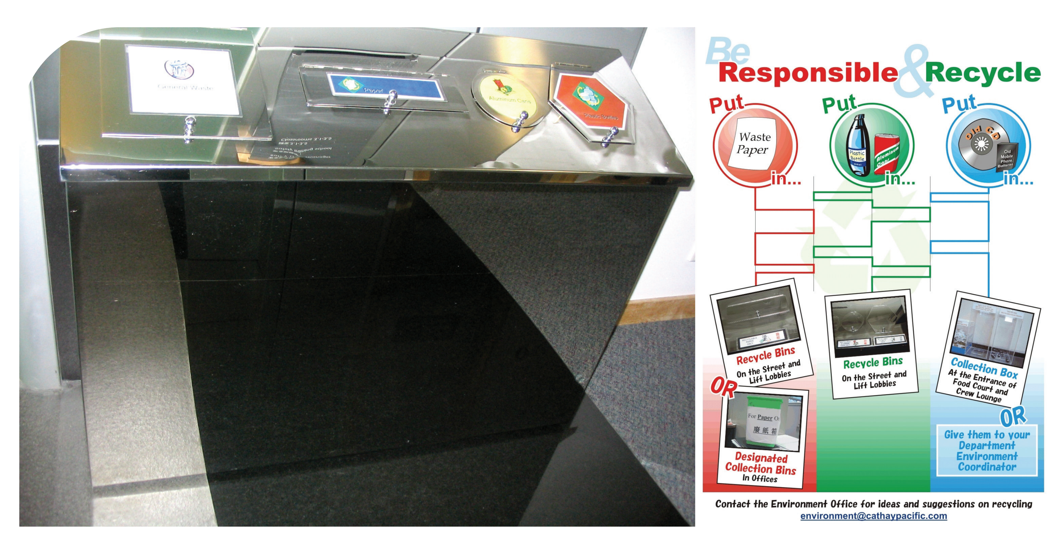
Tackling Emissions - Not just in the Air, but also on the Ground: Waste management.

In 2009, we continued our fleet modernisation programme and introduced 5 more Boeing 777-300ERs (Extended Range aircraft). In addition to introducing more the fuel-efficient ultra long-haul Boeing 747-400ERFs in our fleet, we retired all remaining Boeing 747-200 Classic freighters. We succeeded in further reducing flight emissions through modernising our fleet, enhancing operational procedures, and optimising routes.