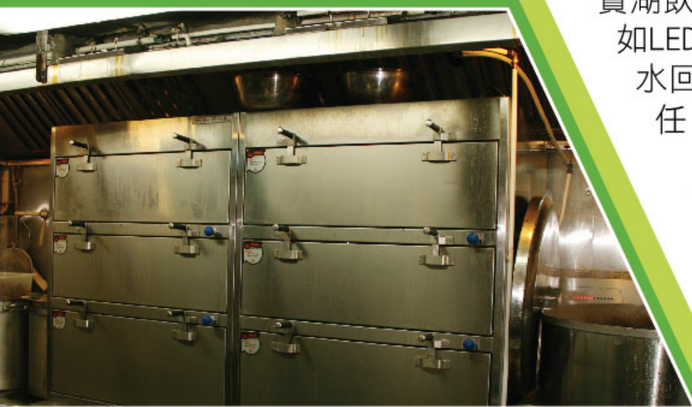
使用節能蒸櫃。 Using energy saving steamers.

Treasure Lake Catering Holdings Ltd. invests in energy conservation and emission reduction systems, such as LED lighting system, steam-water recycle system, energy saving steamers, and wastewater recycle system, etc. While developing the business, the company wishes to take a further step towards fulfilling its social responsibility for environmental protection.