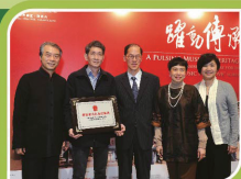
香港中樂團環保胡琴系列榮獲國家「第四屆文化創新獎」(2012)。 HKCO's Eco-huqin Series was awarded the fourth Ministry of Culture Innovation Award of the People's Republic of China (2012).

Hong Kong Chinese Orchestra (HKCO) integrates environmental friendly concepts in manufacturing the Eco-Huqin series honourable of, which has become a major milestone in the development of Chinese music. The python skin of Huqin has been replaced by biodegradable PET membrane. More than 60,000 endangered pythons could be saved given that China manufactures 500,000 Huqin per year.