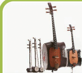
香港中樂團環保胡琴系列包括左起低胡、中胡、二胡、低音革胡及革胡。 HKCO's Eco-huqin Series consists of (from left) gaohu, zhonghu, erhu, bass gahu and gahu.