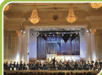
香港中樂團演奏胡琴獨奏及合奏，深受觀眾及主流媒體高度讚賞。 Audiences and mainstream media from Russia showed high appreciation to HKCO's Eco-huqin.