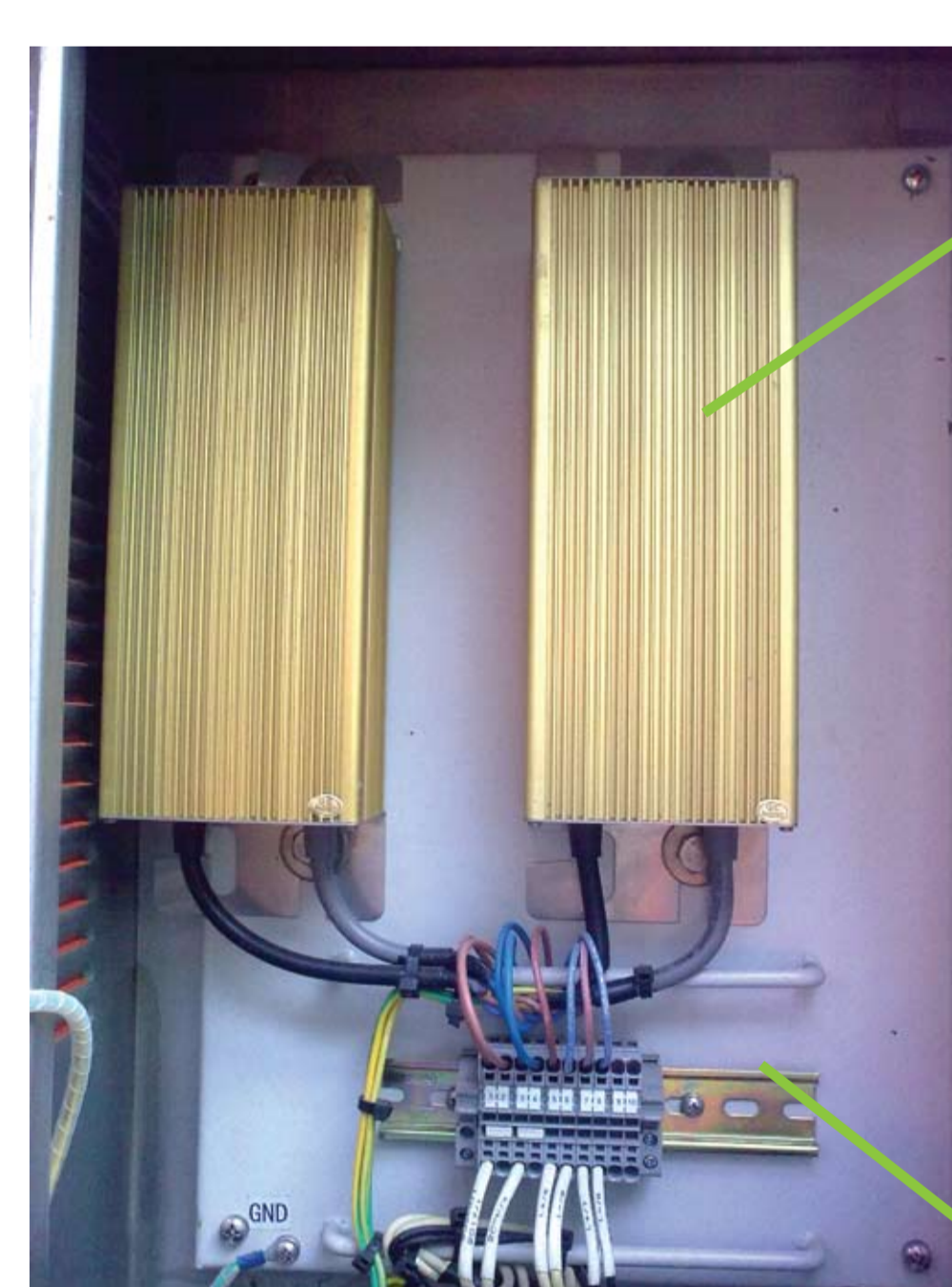
電子鎮流器 Electronic Ballast