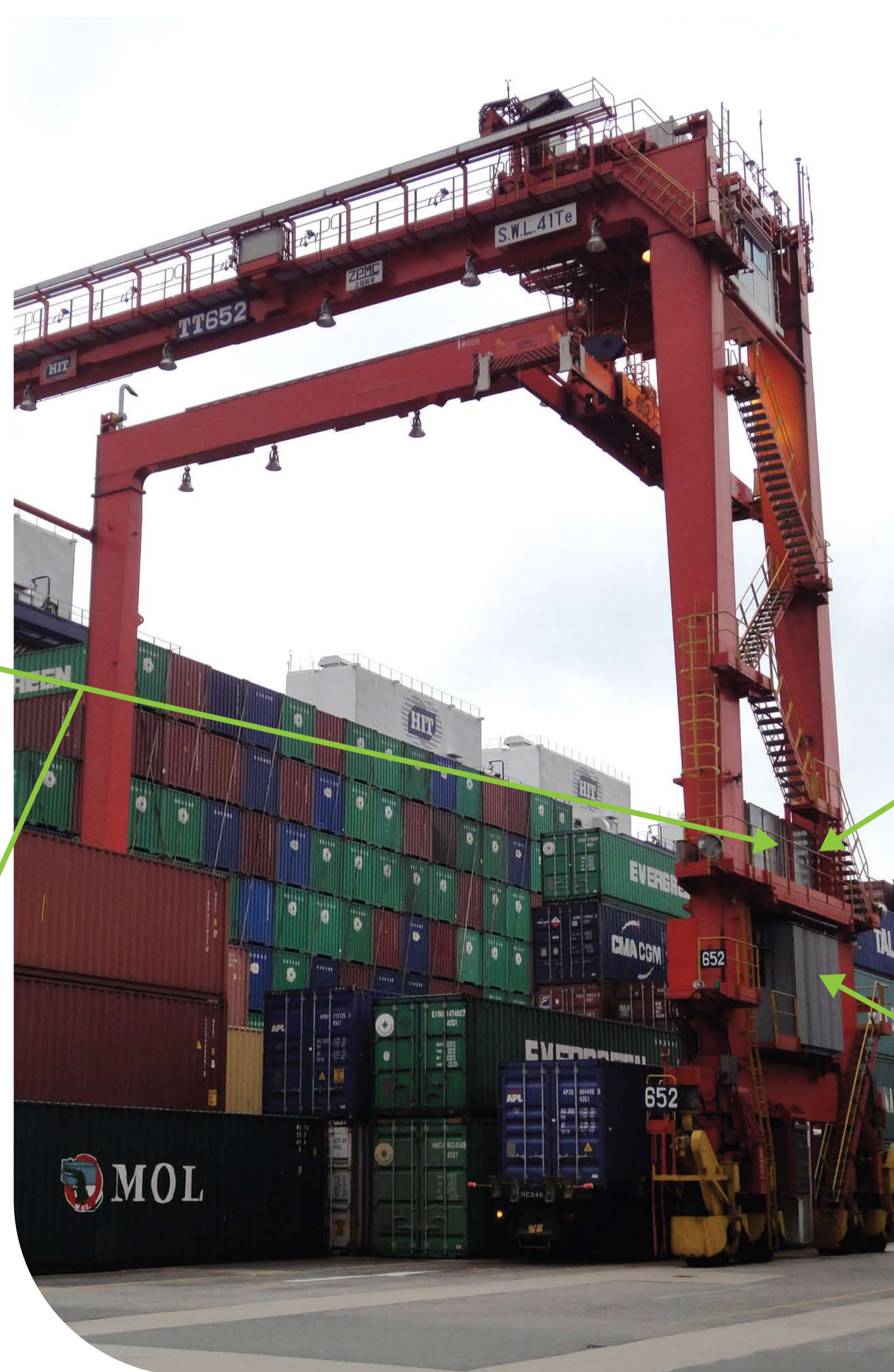
混能龍門吊機：使用鋰離子電池操作吊機以節省能源。 Hybrid Rubber Tyred Gantry Crane : Energy consumption reduced by using Lithium ion batteries as an energy source.