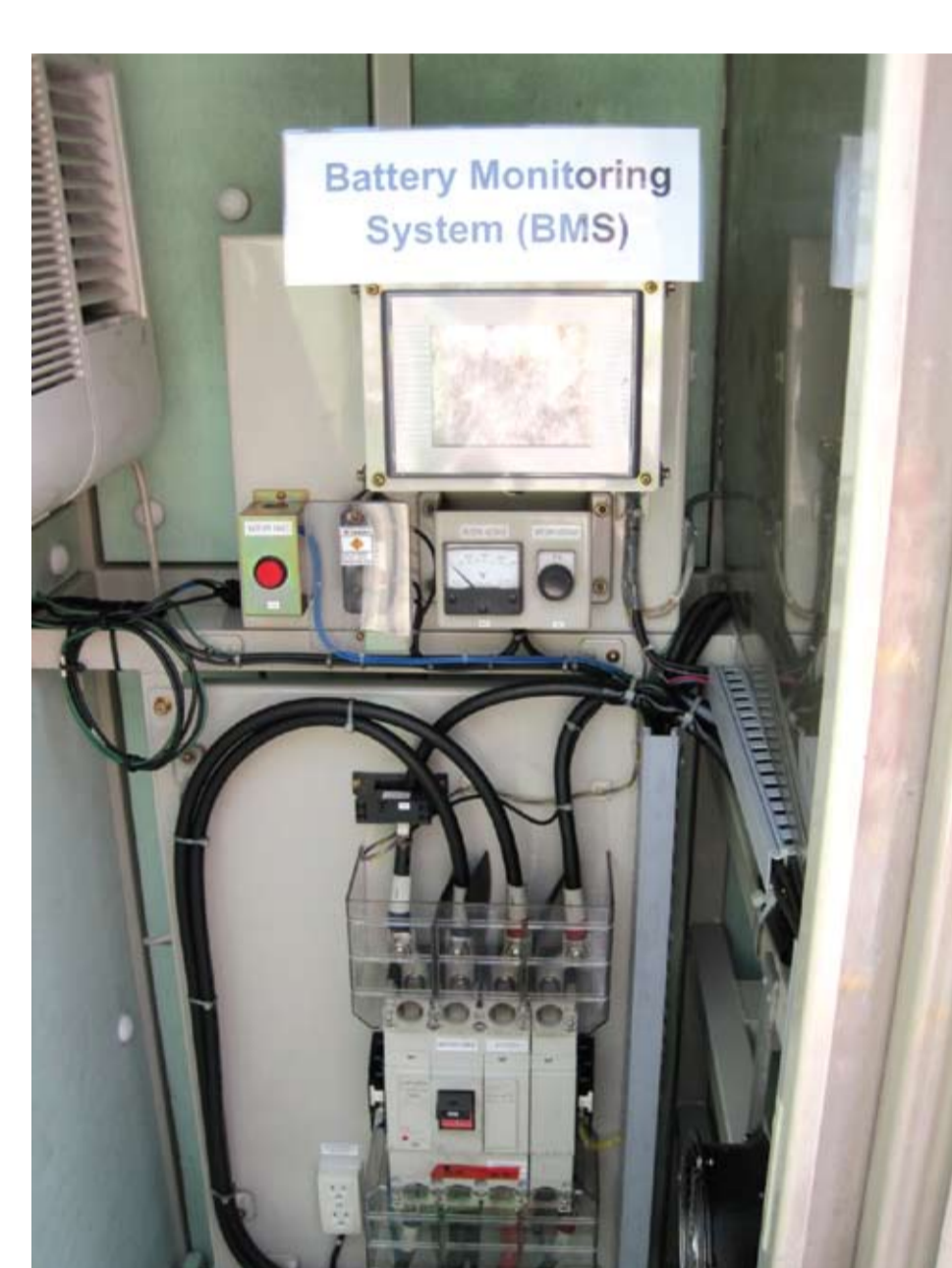
電池效能監察系統 Battery Monitoring System