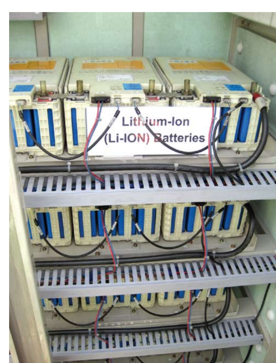
鋰電池櫃 Lithium-ion Batteries Panel

Hongkong International Terminals is committed to protecting our natural environment and resources through conservation programmes and the application of green operations solutions. Many of our green initiatives have exceeded the present statutory requirements and set the benchmarks for the industry.