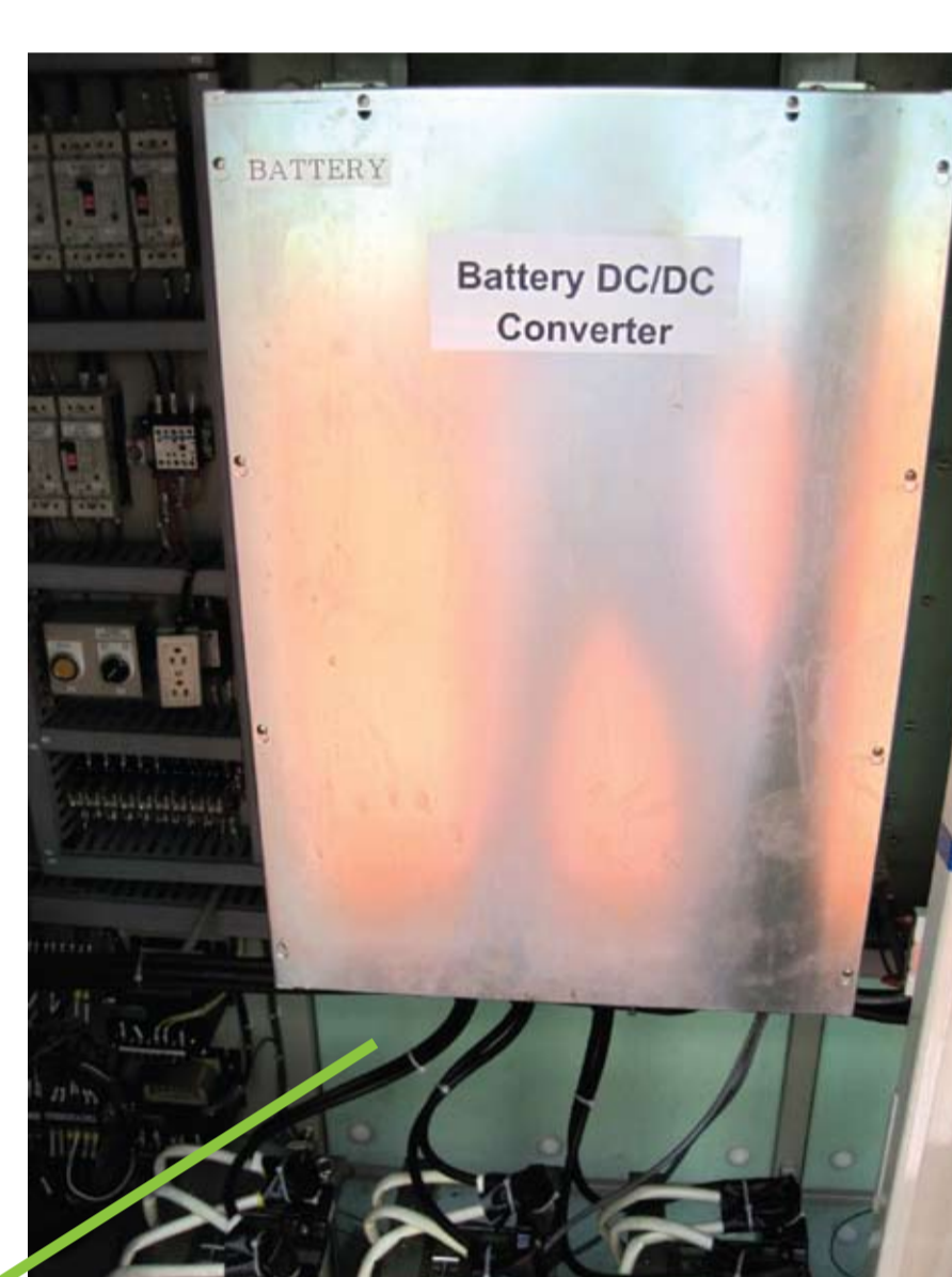
混能轉換系統 Hybrid Energy Conversion System