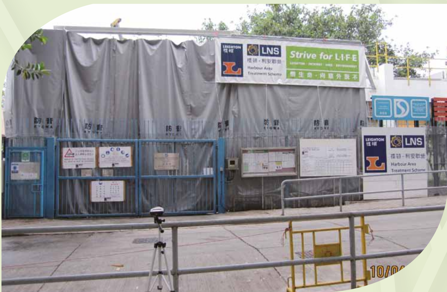
靈活及可重複使用的隔音屏障 Flexible and reusable noise barrier

We are working for a brighter future for the Victoria Harbour. In diligence, we implement diverse and effective environmental mitigation measures, actively communicate with stakeholders and organize community and social events. We strive and have made our project a sustainable endeavor.