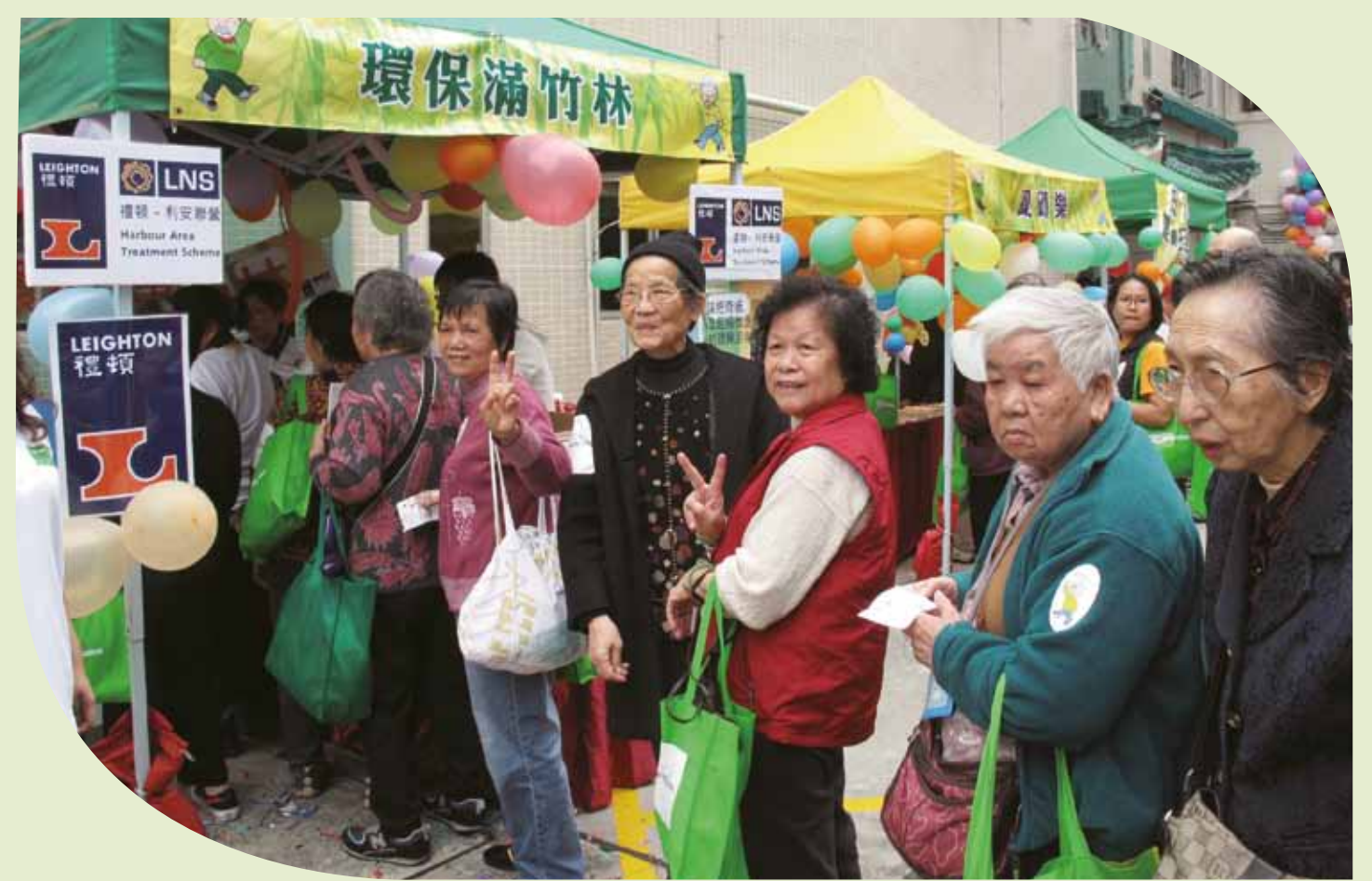
社區關懷行動日 Community Caring Day