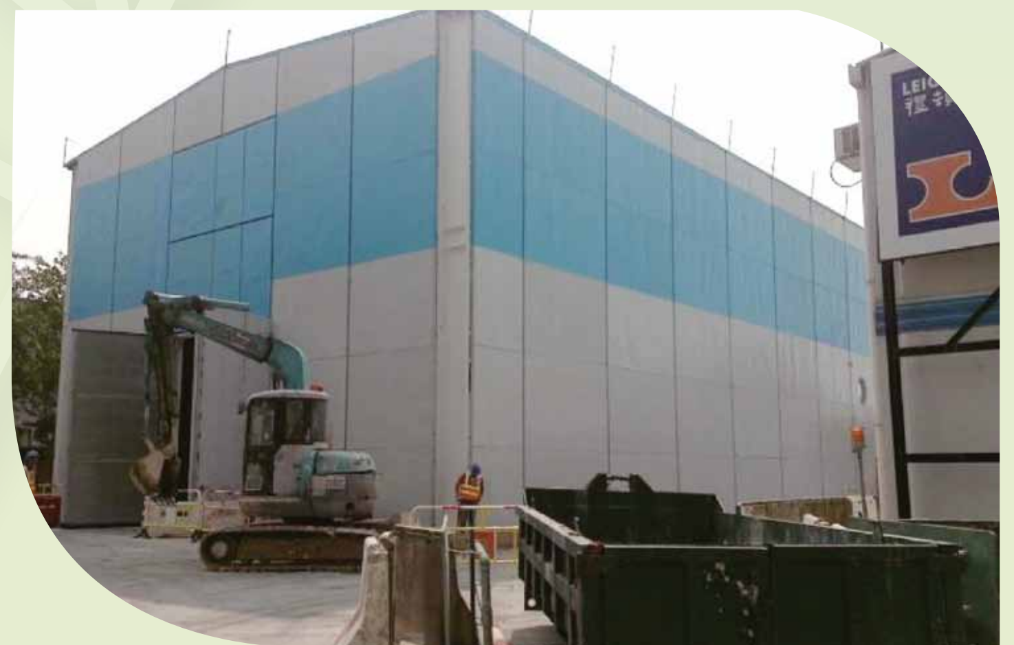
大口環工地已興建可減低 40dB 密封式隔音罩 Noise enclosure at Sandy Bay site which reduces noise by 40dB