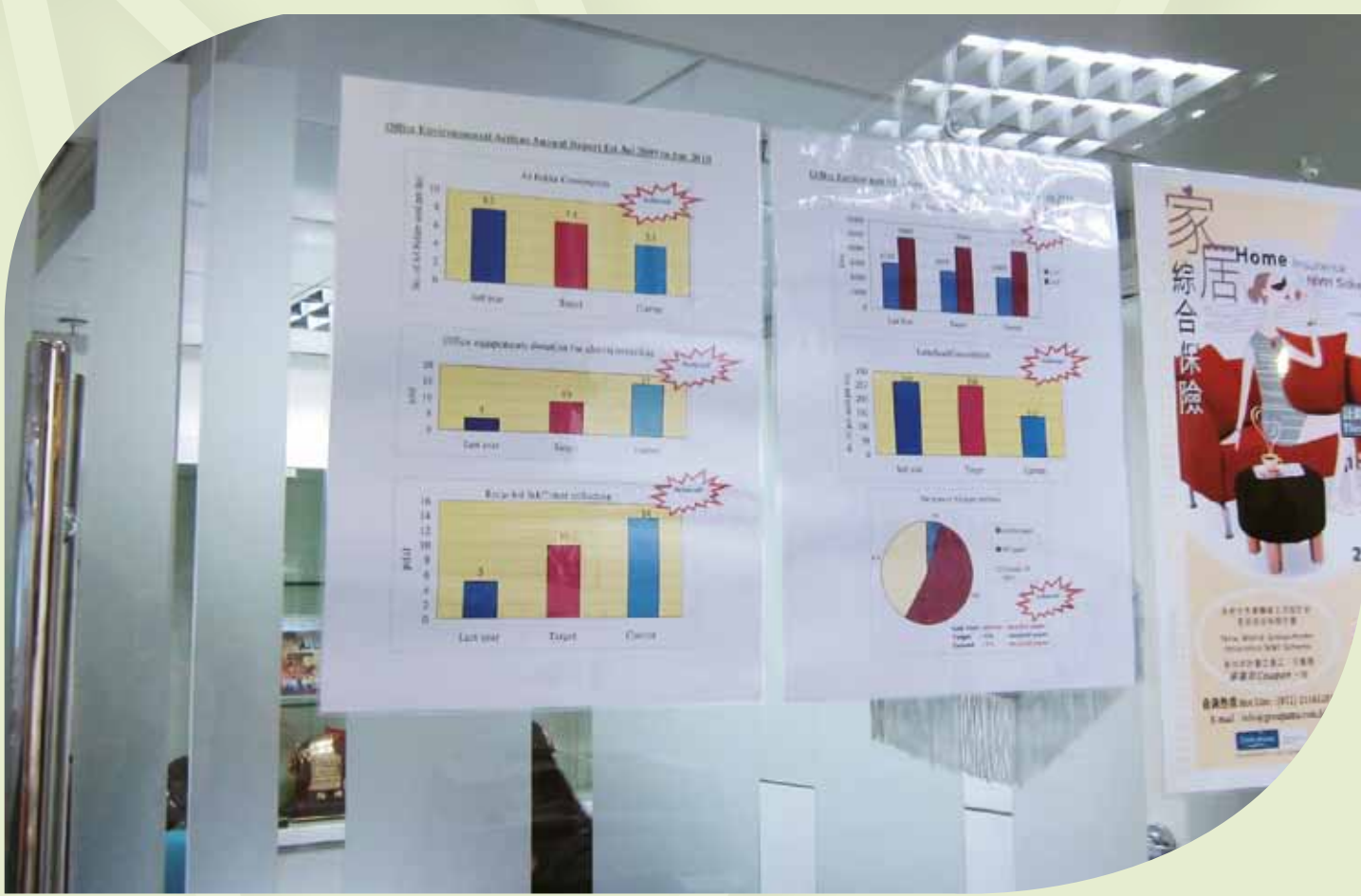
把環保委員會的中期及年度報告張貼於當眼處，讓員工對公司環保措施的進度有清晰的了解。 The interim and annual reports of Nova Insurance Environmental Committee are posted in office for updating staff about the environmental progress.