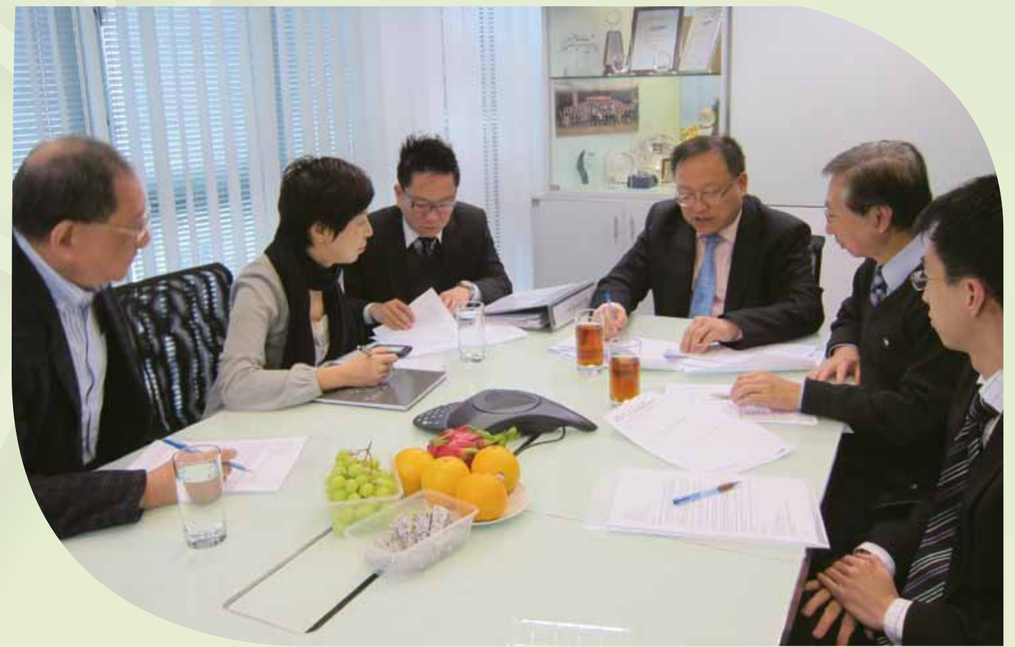
為減少使用即棄餐具，及積極響應低碳飲食，我們把提供外賣早餐的部門主管會議，由早上改為下午舉行，並以水果代替早餐。 To reduce the disposal of cutlery and support low carbon diet, we rescheduled our monthly team leaders meeting from morning to afternoon. Fruits are provided instead of take-away breakfast.