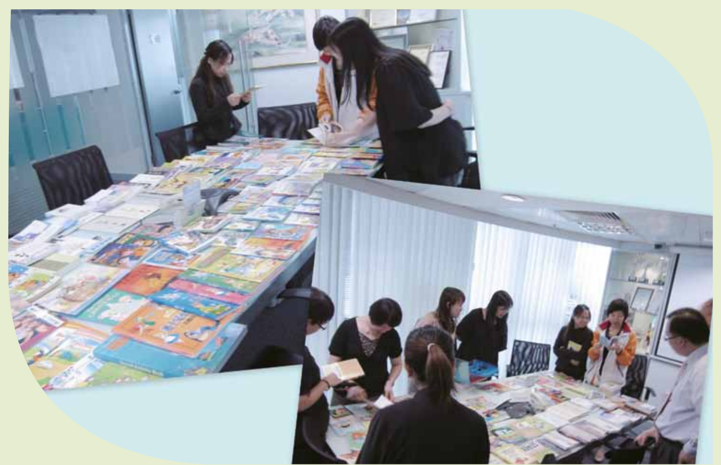
我們於2010年7月舉行「書籍交換日」，並把賣書的收益及剩餘的書籍，捐給慈善機構。 We held the "Book Exchange Day" in July 2010. The proceed and the remaining books were donated to charitable organizations.