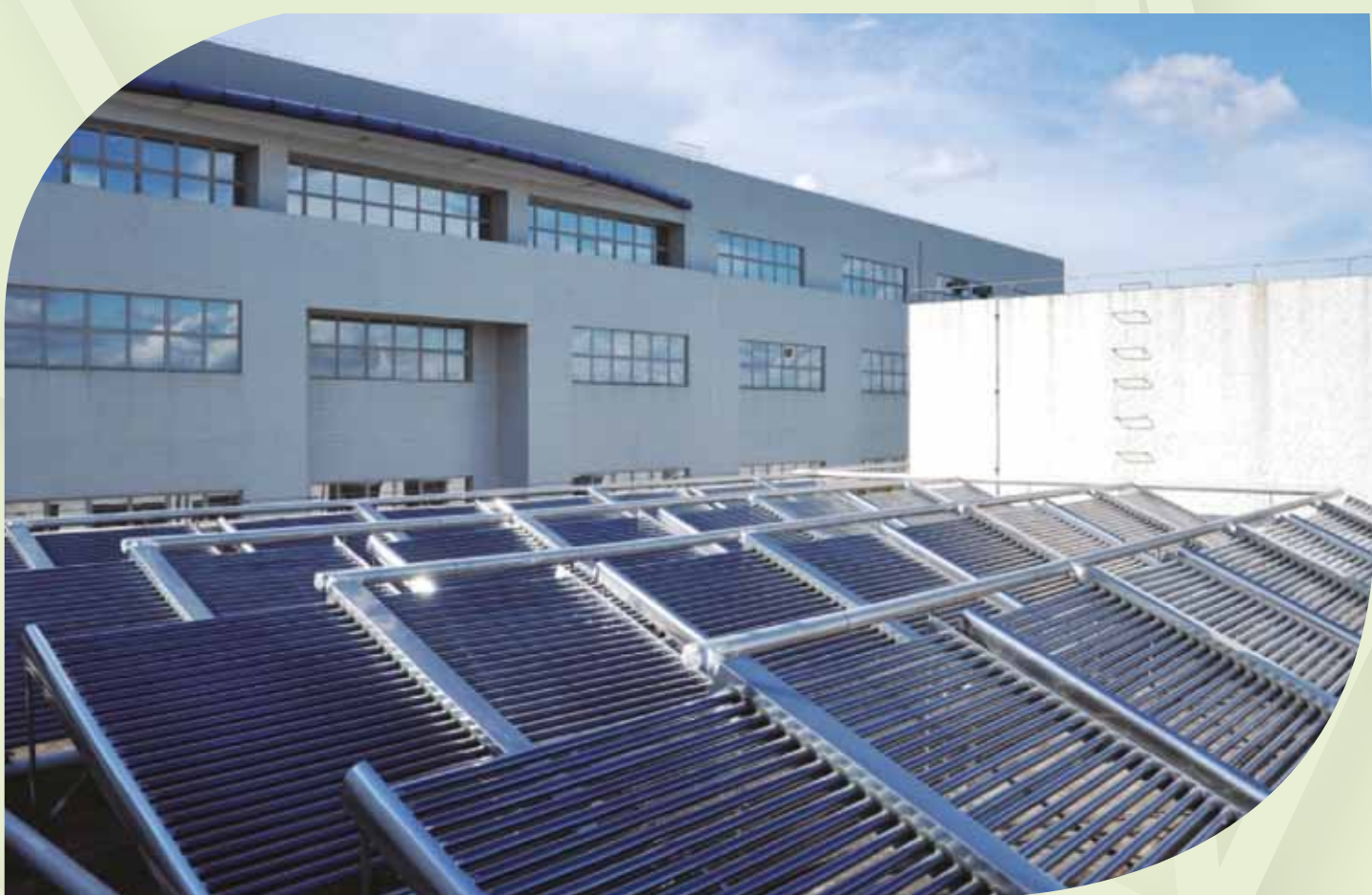
善用再生能源 - 宿舍用水採用太陽能供熱系統 Using solar water heating system in dormitories

As a cut-and-sewn-knit garment production owned by Elegance Industrial Ltd. (a subsidiary of Crystal Group), Dongguan Crystal Knitting & Garment Co. Ltd. (DCKG) follows the Group's environmental policy. DCKG has adopted ISO 14001 Environmental Management System since 2003. We focus keenly on implementing energy saving and pollution prevention projects, as well as launching environmental promotion campaigns to raise the awareness of employees and the public. DCKG will continue to put more resources for improvements, especially in effluent treatment and further energy saving, in order to pursue sustainability.