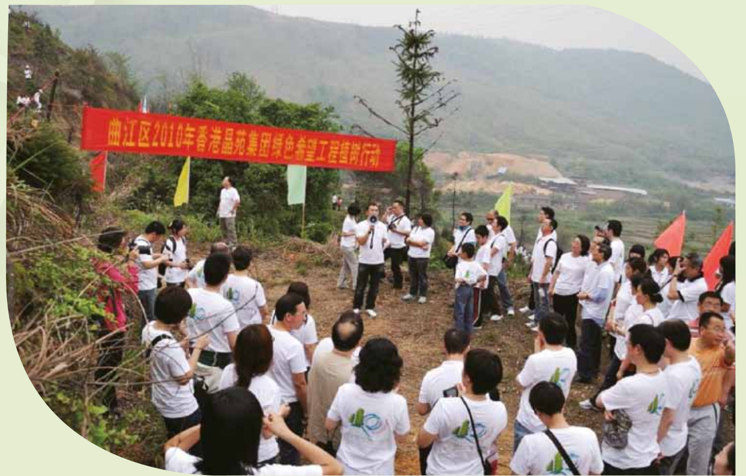
員工與管理層一同參與植樹活動 Staff and management team planted trees together