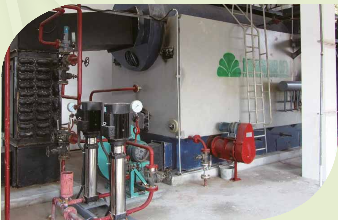
採用BMF生物質鍋爐系統提供蒸汽，進一步節能減碳。 Boiler system operated on biomass-fuel is used for steam generation to enhance low carbon emission.