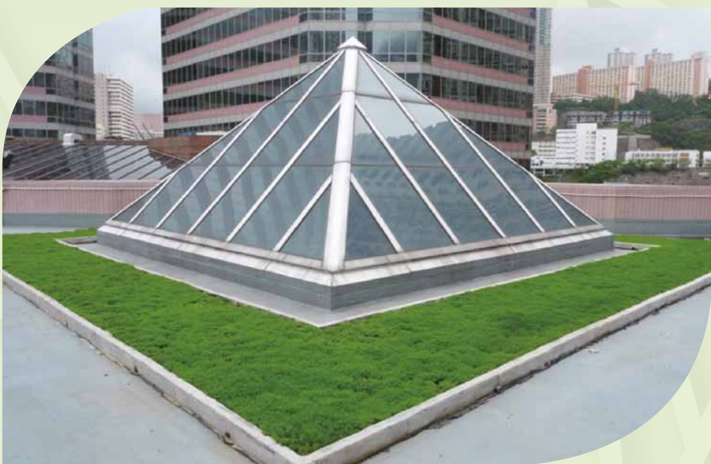
於噴泉廣場及5樓天台種植有助降低室溫的佛甲草地 Fijian Grass fields at Open Piazza and L5 Roof tops help to lower the room temperature underneath

Metroplaza, under the quality management of Kai Shing Management Services Limited, is successfully building a "Green Community". Reducing carbon emissions and promoting carbon reduction awareness in the community have been achieved through launching the "Environmental Management Programme". The environmental management has reached a higher level.