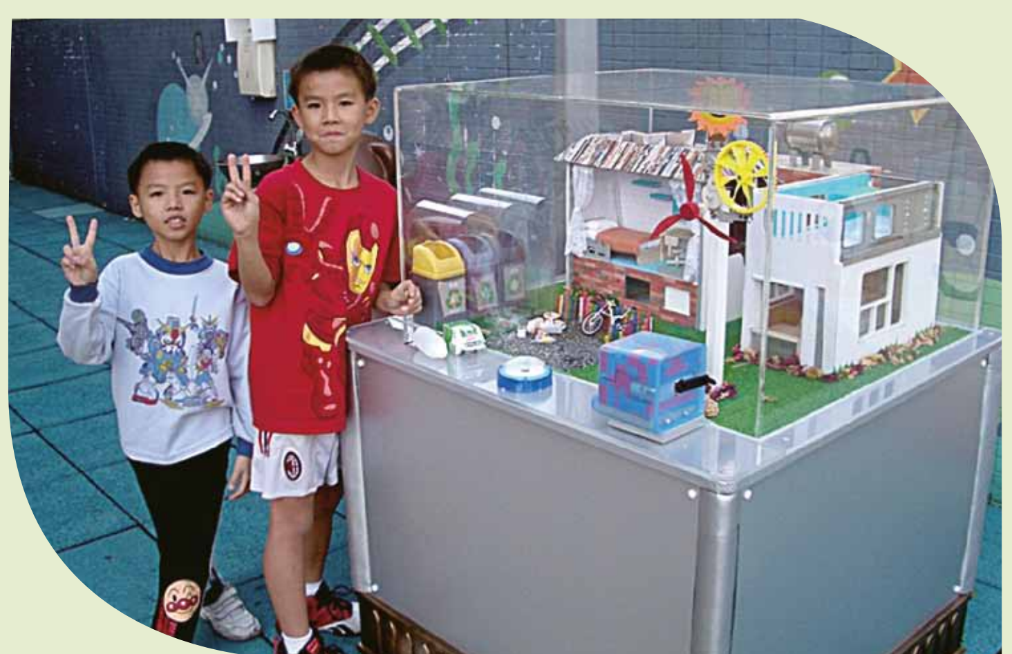
向下一代宣傳可再生能源的運用 Promote renewable energy to the next generation