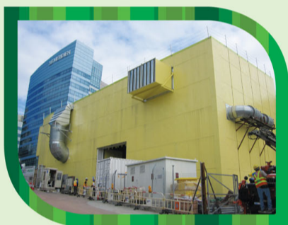
在數碼港已興建可減低 40dB (A) 密封式隔音罩 Noise enclosure with 40dB (A) noise reduction at Cyberport site

We are working for a brighter future for our Victoria Harbour. In the meantime, in addition to our diligent implementation of diverse and effective environmental mitigation measures, active communication with stakeholders and organizing of community social events have facilitated the sustainability of our project.