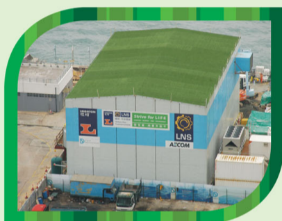
在西營盤工地已興建可減低 40dB (A) 密封式隔音罩 Noise enclosure with 40dB (A) noise reduction at Sai Ying Pun Site