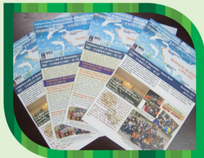
使用石頭紙作社區項目季刊 Quarterly Community Newsletter printed on Stone Paper