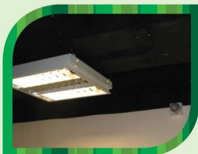
裝設感應系統，節省用電。 Installed motion detection sensors to save electricity.