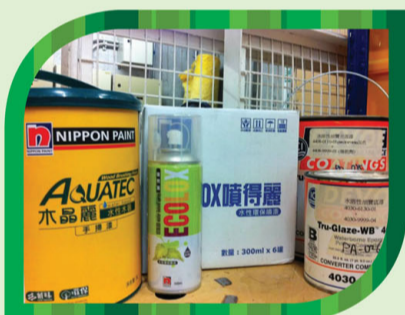
使用水溶性及不含揮發性有機化合物的油漆翻新單位。 Water-based paints without volatile organic compounds were used for re-painting apartments.