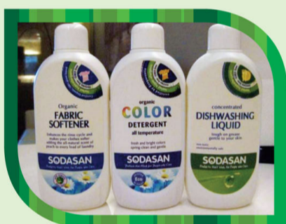
使用可自然分解的清潔劑、洗衣劑及碗碟清潔液。 Using bio-degradable cleaning, laundry and dish-washing detergents.