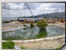
建造臨時蓄水池，以收集、儲存、初步處理及直接循環再用地表水及雨水。 Construction of a temporary water pond for collection, storage, preliminary treatment and direct reuse of surface run-off and rainwater.