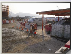
使用太陽能定時噴霧灑水系統，減少耗用天然資源。 Saving of natural resources by the use of solar-powered and timer-controlled mist sprinkler system.