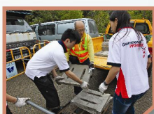
運送行人路磚到鳳園。 Transferring bricks to Fung Yuen.