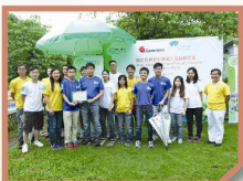
參與鳳園蝴蝶保育區行人徑修復計劃。 Participating in the Fung Yuen Butterfly Reserve Footpath Restoration Project.