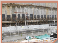
預製模塊擋土牆。 Precast modular retaining wall construction.

The project involves the widening of a section of Tolo Highway/Fanling Highway of approximately 3.5-km long between Ma Wo and Tai Hang from the existing dual 3-lane carriageway to a dual 4-lane carriageway with standard hard shoulder on both directions. Over the past year, the project team has made great efforts in preserving trees by improving the construction method statement and adopting environmental friendly measures. The precast modular retaining wall construction method is a remarkable example of sustainable development in the construction industry.