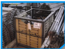
重用鋁質腳架。 Reuse aluminum scaffolding.