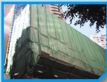
採用雙層隔聲帆布進行嘈雜的工程。 Double-layered acoustic sheet was erected adjacent to noisy works.