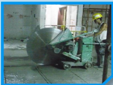
在地下室採用鋸切的方法，盡量減少塵土污染。 Adoption of saw cutting method at basement to minimize dust pollution.

Environmental protection is the most important social responsibility of Projexasia Limited and we aim to actively participate in building a better environment for Hong Kong. We strive for continuous improvement to perform better and are honored to receive the SME Award under the Construction Industry sector in 2012 HKAEE, which acknowledges and encourages our continuous efforts and achievements in environmental management.