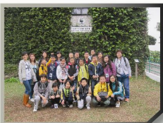
瑞士銀行定期與世界自然基金會和保良局環保及慈善機構合作，舉辦與環保有關的員工活動。 UBS regularly co-organises staff environmental activities with environmental and charitable communities such as WWF and Po Leung Kuk.