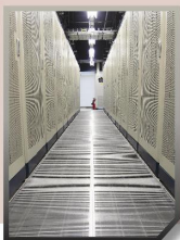
在數據中心和辦公室採用符合能源效益的設計和設備，有助降低能源用量。 The use of energy-efficient systems in data centres and office helps reduce energy consumption.

UBS is committed to acting in an environmentally responsible manner in all business dealings. Our environmental policy stipulates that we identify and manage environmental risks; provide clients with a range of financial products and services that address environmental challenges; and continuously improve our resource efficiency and environmental performance. We also encourage our employees to participate in environmental activities that benefit the environment and communities.