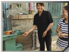
每年瑞士銀行均投資清潔發展機制中黃金級標準認證的環保項目，完全抵銷總業務行的碳排放。 Every year UBS offsets 100% of carbon emissions from business-related air travel by investing in the Gold Standard Certified Projects of the Clean Development Mechanism.