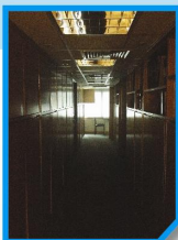
在午膳時段關掉不需要的照明系統。 Turn off unnecessary lighting during lunch time.