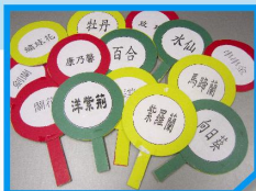
我們公司春筵所使用的枱號名牌已經使用超過三年。 We have re-used the table number stands for our spring dinner for over three years.