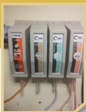
大量購買可自然分解的補充裝清潔劑，節省膠樽。 Bulk purchase of refillable bio-degradable detergents to reduce the use of plastic bottles.