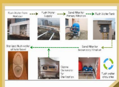
於2012年引入全新過濾及消毒系統淨化開沖水，減少使用化學清潔劑。 Installed a new Filtration & Sterilizing System for toilet flushing water in 2012 to reduce the use of chemical cleaning detergent.

Gateway Apartments is fully committed to implementing environmental practices. A major achievement was the installation of a highly efficient and comprehensive solar panel system which reduces carbon emission. We hope that our efforts will inspire others to follow in making our City a greener place.