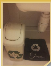
每個單位放置環保袋及回收箱，讓住戶進行家庭垃圾分類。 Provide recycling bags and a recycling bin in each apartment for household waste separation.