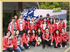
公司每年都會積極參與各類環保活動及舉辦生態旅遊，希望藉此教育員工及其家屬環保的重要性。 We actively participate in different green programs and organize eco-tours every year with a view to enhancing the environmental awareness of staff and their families.