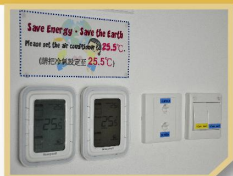
公司使用節能設備、回收舊紙和膠粉、控制空調溫度、在午間關燈，致力打造綠色辦公室。 We are dedicated to building a green office by using energy efficient equipment, collecting paper and toners for recycling, controlling air-conditioning temperature and switching off the lights during lunch hour.