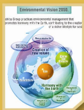
集團制定了「環境願景2050」。 The Group has developed the "Environmental Vision 2050".

Toshiba International Procurement Hong Kong Limited, a subsidiary of Toshiba Corporation Japan, provides China oriented procurement services to headquarter and its group companies. We stay true to Toshiba Group's commitment "Committed to People, Committed to the Future" and strive to promote environmental management and become one of the world's foremost eco-companies.