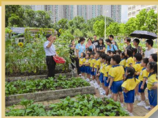
去年超過一千名幼稚園學生、小學教師和社區團體人士參觀本校環保設施。 Last year, over 1,000 kindergarten students, primary school teachers and community group representatives visited the green facilities of our school.