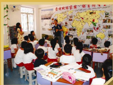
地球室圖庫以難題有生態和天文館。 The 'Earth Explorer' museum comprises the ecosystem and astronomy pavilions.