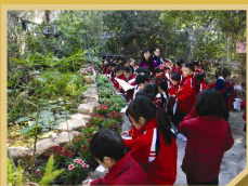
蝴蝶園內的主要池、綠蔭和沙灘是常識科教學平台。 The ecological pool, Junissio Park and Gola desert in the Butterfly Garden provide a teaching platform for General Studies.

Our four environmental goals include: to establish a sustainable 'green learning' on campus; to join hands with parents in establishing a lifelong and green living lifestyle; to promote 4Rs (Reduce, Recycle, Reuse, Replace), energy saving, carbon reduction and organic planting; and to integrate environmental education in the curriculum and to help enhance the awareness of the public.