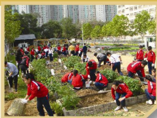
將停車場改建為有機種植園，設置多元教學有機苗圃。 The former car park has been converted to an organic garden with a multi-educational and self-sustaining vegetable nursery.