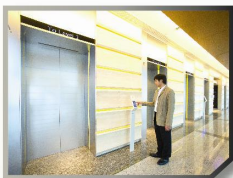
控制升降機的運作數目和時間，節約能源。 Controlling the number of lift runs and service hours for energy conservation.