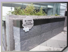
收集雨水灌溉植物。 Collecting rain water for watering plants.

International Commerce Centre (ICC) is managed by Kai Shing Management Services Limited. Kai Shing strives to make ICC the most environmentally friendly building in Hong Kong. ICC Management Services Office takes environmental considerations in its daily operation and management planning. We also work with our tenants, contractors and consultants in promoting energy conservation and greening. On top of that, we seek new green measures by encouraging staff and tenants to offer suggestions.