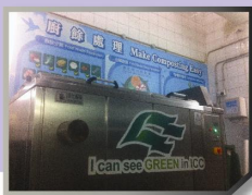
收集廚餘，回收再用。 Collecting food waste for recycling.