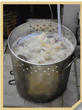
自家研發蒸菜噴水，大大減低食水耗用量。 Self-invented water spraying method by use of an air pump, which significantly reduces fresh water consumption.