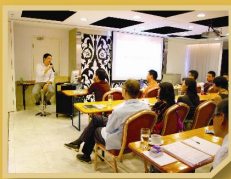
與業界分享，共同創建環保餐飲管理文化。 Sharing session in the industry aiming to create a green management culture.