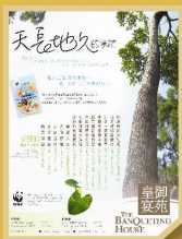
首創首屆榮獲世界自然基金會香港分會指南所設計的環保海鮮婚宴菜單。 The first automatic seafood wedding menu in Hong Kong which is drawn up in accordance with the WWF-F&B seafood guide.

The Banqueting House is a Chinese F&B brand that actively participates in environmental activities and is committed to protecting the environment. We have not only introduced energy saving facilities and encouraged staffs' participation, but also collaborated with environmental organizations on experience sharing in the F&B industry.