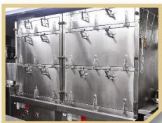
與東氣公司共同發展及推廣使用環保節能高效的蒸氣蒸爐。 Collaborating with the Toengas to develop and promote the use of the energy-efficient Super Gas Steamer Series.